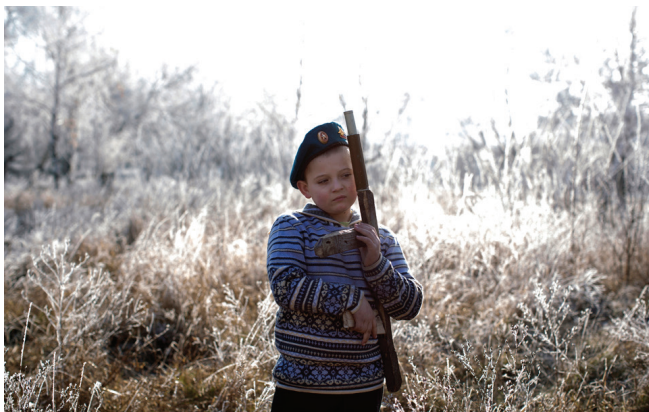
Donetsk, Ukraine 2015/2016

All images ©Niclas Hammarström/Kontinent Agency