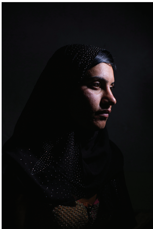
Sinjar, Iraq 2015/2016