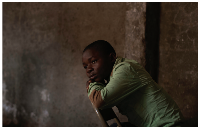
Bukavu, Congo, 2015/2016

School children playing outside their school. Raia Mutomboki (RM) rebels live just a few kilometers away. They often come and kidnap villagers and then request a ransom.