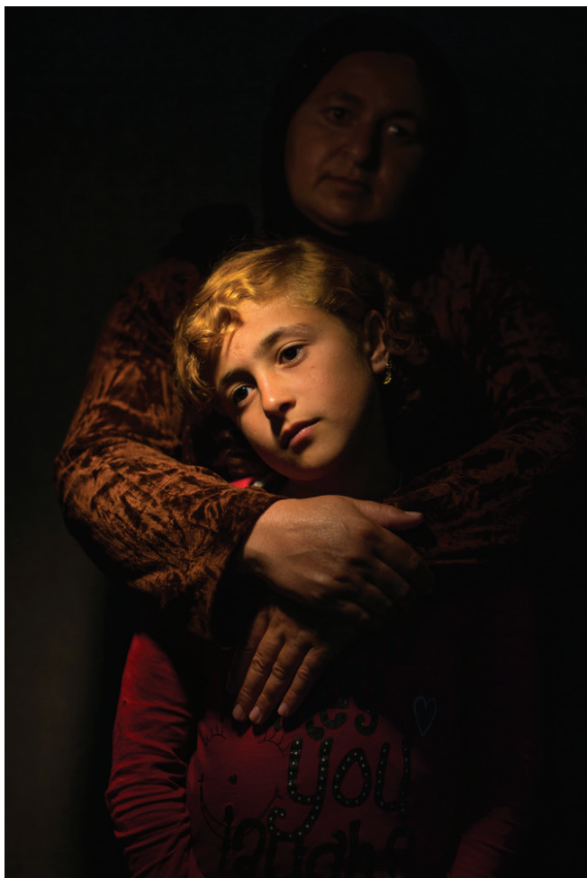
Dohuk, Iraq 2015/2016