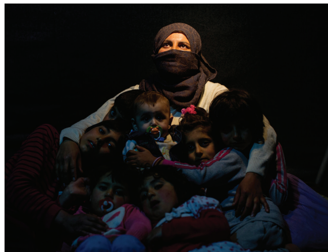
Dohuk, Iraq 2015/2016