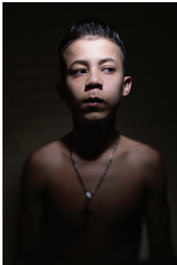
San Pedro Sula, Honduras, 2015/2016