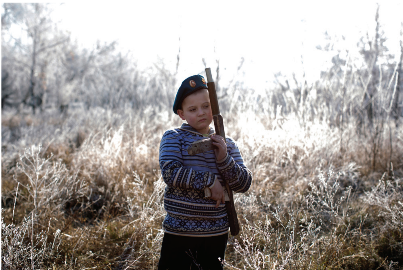
Ukraine, 2015/2016

Kontinent Agency presents the exhibition