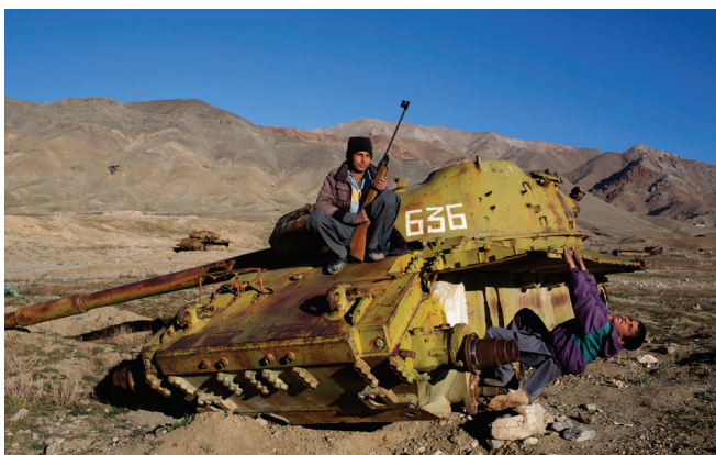
Panshir, Afghanistan 2015/2016