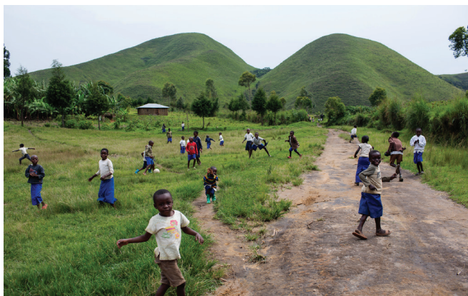
Nzibira, Congo, 2015/2016