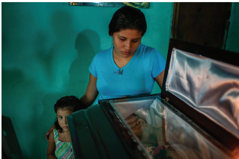
San Pedro Sula, Honduras, 2015/2016