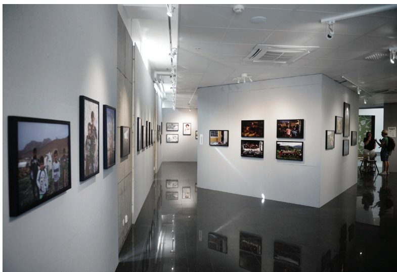
"War Child" by Niclas Hammarström, Stockholm, Sweden, May 2016

e-mail: malin@kontinent.se tel: +46 (0) 7 22 62 96 14 web: www.kontinent.se